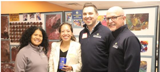
Trustees at the 2024 Black History Month Celebration Reception