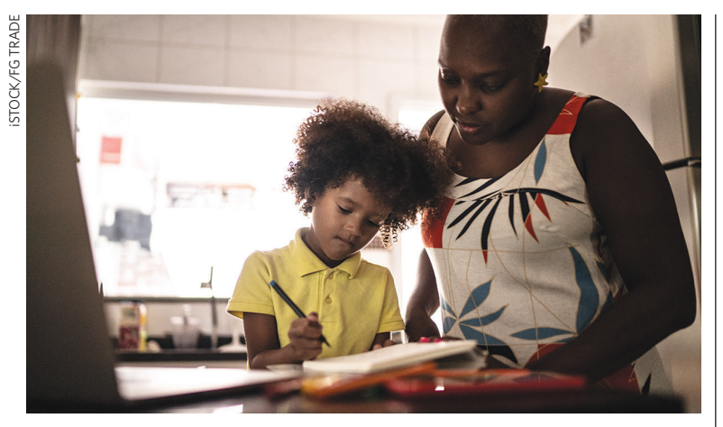
The Department of Education has ordered school districts to use an unlawful process to inflate the amount of federal COVID-19 aid they must share with private schools. In a lawsuit filed in July, the SPLC and co-counsel challenged the illegal rule.