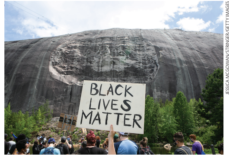
The SPLC has called for the removal of the carving on Georgia's Stone Mountain, the world's largest monument to white supremacy and the centerpiece of a state park.

SPLC won a court battle to at last force its removal.