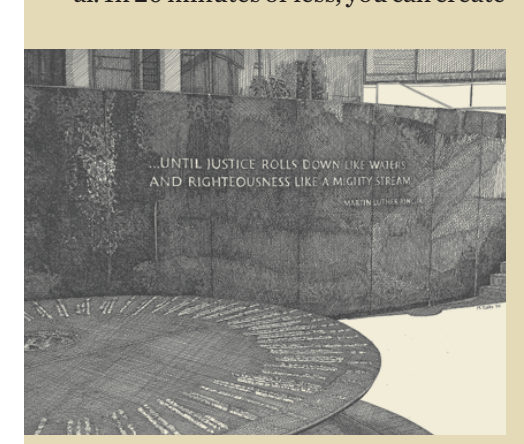
Civil Rights Memorial

There are several ways to join Partners for the Future, but the easiest way is to visit FreeWill.com/SPLC and follow along with the free tutorial. In 20 minutes or less, you can create